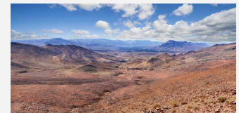
90° Wide Angle 8MP UHD Spotter Camera for Situational Awareness