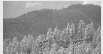
Fog Filter (Visible Cut) Enabled