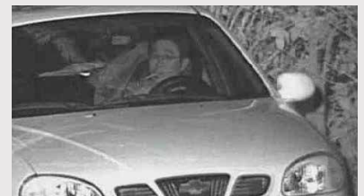
See through windows with ZLID