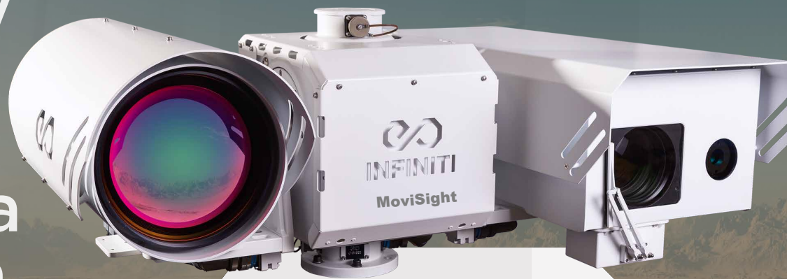
Shown with optional ZLID Illuminator.

The Vega is a revolutionary multi-sensor PTZ camera boasting a long-range 135X visible day/night camera, long-range thermal infrared zoom, and optional ZLID NIR illumination with LRF. This multi-sensor payload enables the Vega to provide high resolution imaging in virtually any environment from heavy fog to complete darkness. Designed for accurate positioning of weapons systems, the pan/tilt unit meets and exceeds MIL-STD-810F military ratings for shock, vibration, temperature and dust/water ingress. This makes the Vega the ultimate long-range camera system for 24/7 situational awareness and long-range recognition and identification of targets.