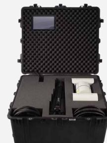
Rapid Deployment Kit