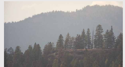
Fog Filter (Visible Cut) Disabled

IR illumination allows for detailed video when there isn't enough natural light, however for long-range IR illumination a laser is needed. Many laser illuminators overexpose the center of the screen and leave the edges dark. Infiniti's ZLID (Zoom Laser IR Diode) technology synchronizes the IR intensity and area illumination with the zoom lens for outstanding active IR performance, eliminating over-exposure, washout, and hot-spots for clear images in complete darkness.