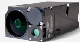
LRF (up to 20km range)